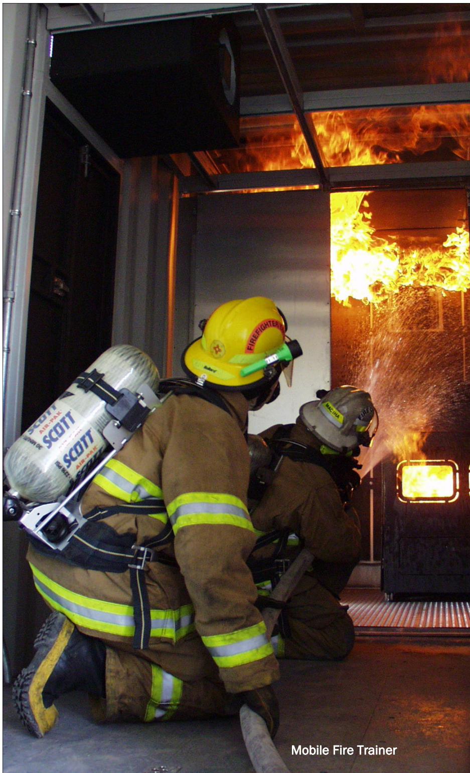
Mobile Fire Trainer