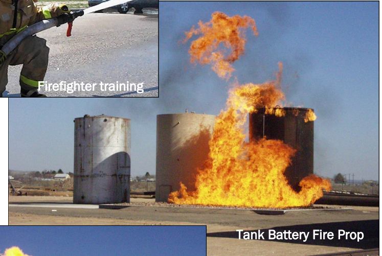
Tank Battery Fire Prop