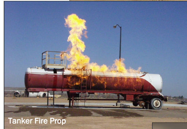
Tanker Fire Prop